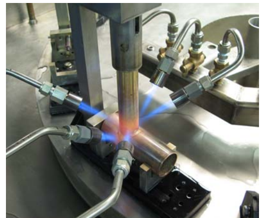
Precision heat pattern distributes filler metal throughout the joint, resulting in leak-free joints.